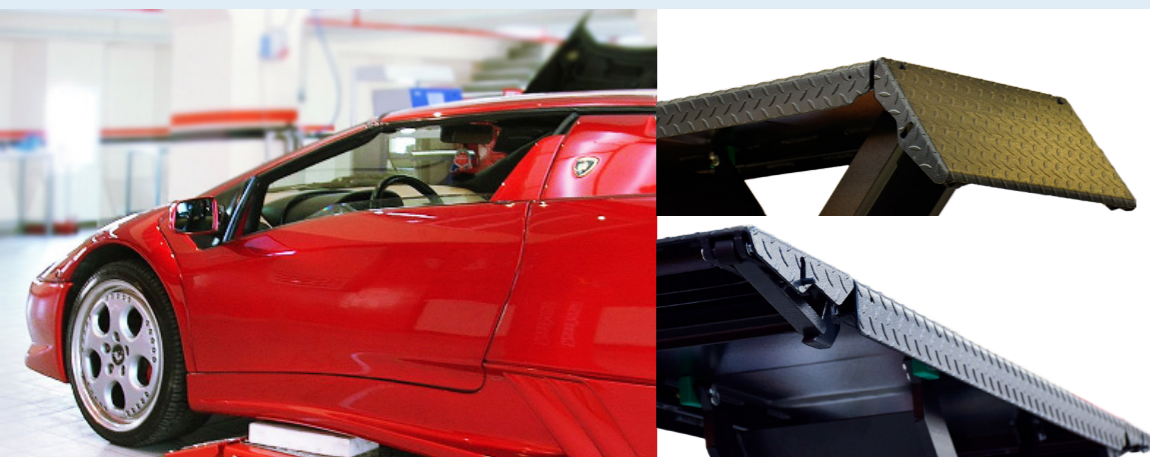
Very flat construction: Perfect for sports cars