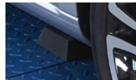
Truncated pyramid pad