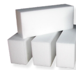
Polymer pads 100 x 150 x 340 mm