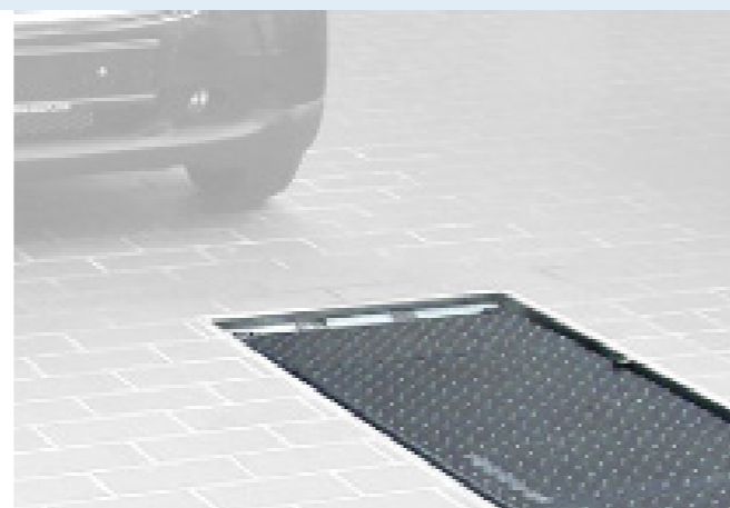
In-ground or above ground installation