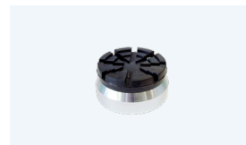
Height adapter 44 mm*