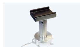
U-form adapter 150-233 mm*