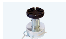
Height adapter 155-245 mm*