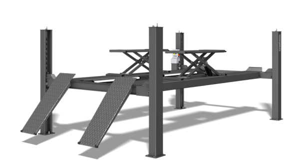
COMBILIFT AMS Runway with recesses for turntables in front and sliding plates in the back